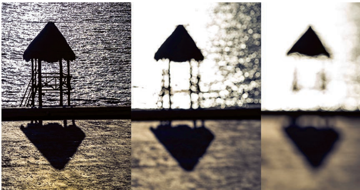
Triptych Cancun