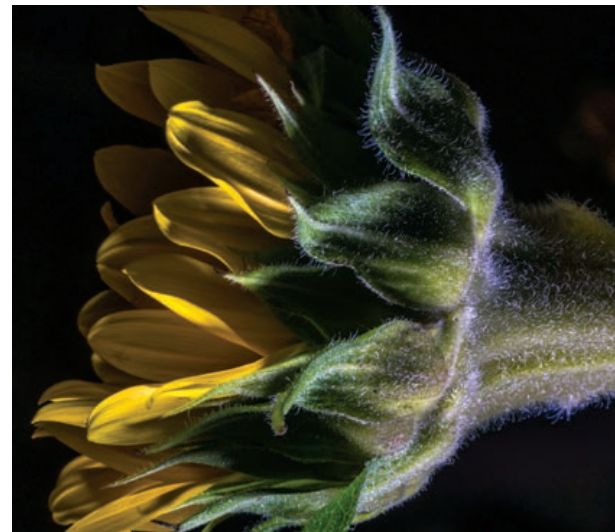
Flowers #9

This winter he will be teaching three classes: Beginning Digital Photography , Advanced Beginner Digital Photography and Lightroom Fundamentals . He will also teach two workshops: Photo Field Trip: Winter Wonderland and Balancing Whites in Lightroom .