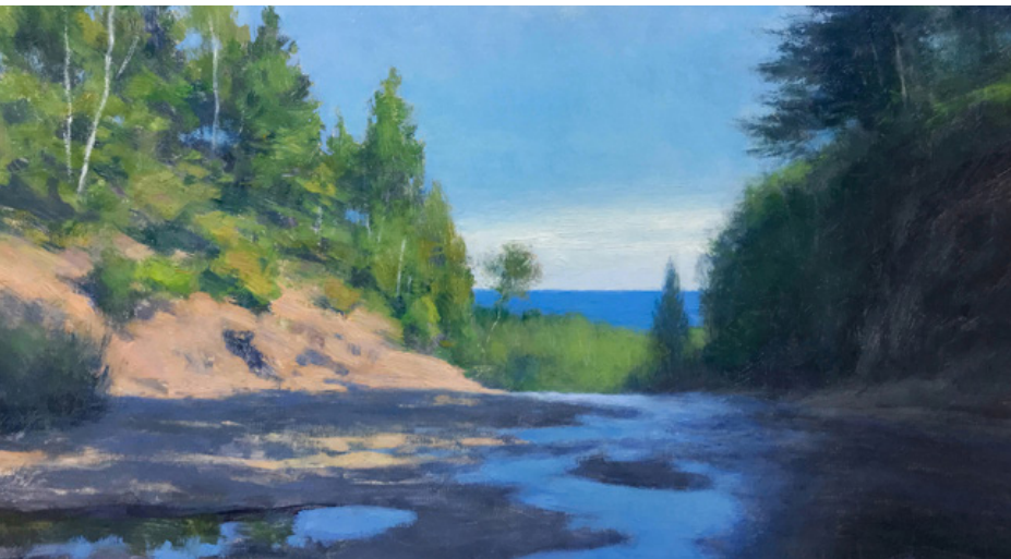
Clear Blue Over Lake Superior by Christopher Copeland