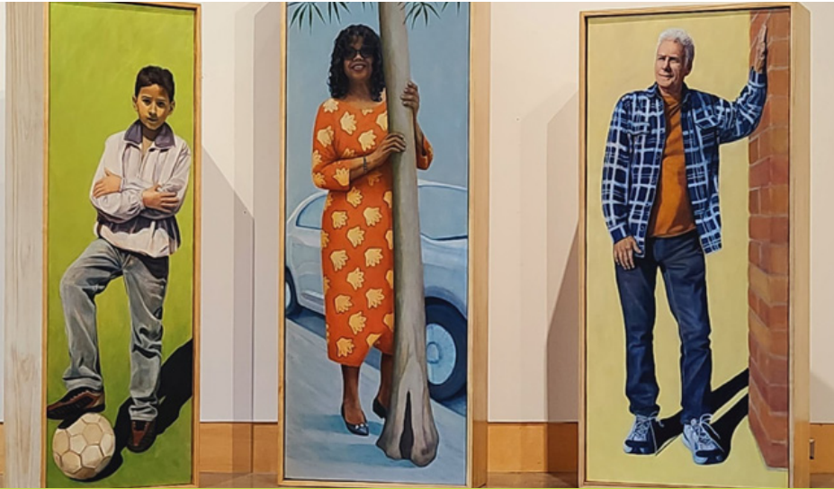
Peopled Boxes by Barbara Lidfors

Interested in modeling for a figure drawing (nude) or portrait drawing (clothed) class? Contact bbowman@minnetonkaarts.org for details.