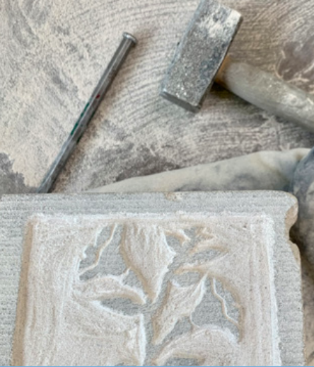
Student work from Stone Carving Studio

Enrollment limited to 12; ages 10 and up E053W24 Saturdays, May 25 - June 8 (2 sessions) 1 - 3:30 p.m. No class on June 1 $132 Members / $142 Non-members