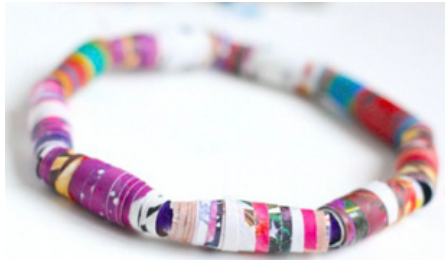
Paper Bead Bracelet

Enrollment limited to 12; ages 8 and up E137W24 Saturday, May 18 (1 session) 1:30 - 3:30 p.m. $43 Members / $47 Non-members