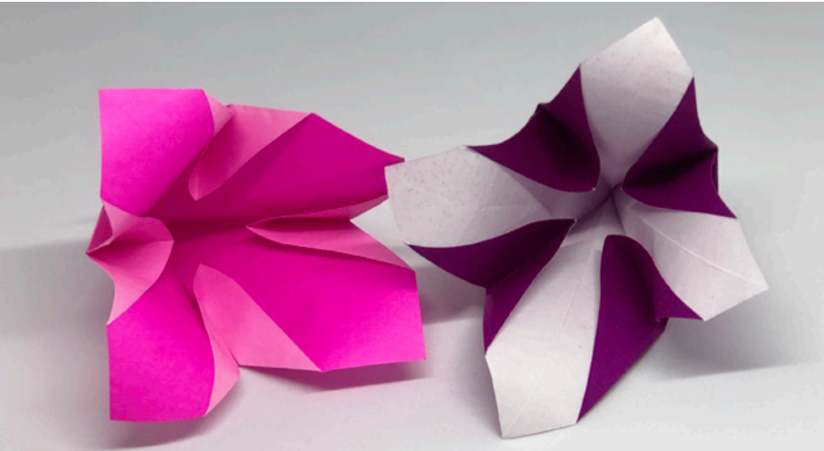
Origami: Cherry Blossom Time

Enrollment limited to 12; ages 8 and up D058W24 Saturday, April 13 (1 session) 1 - 3 p.m. $31 Members / $33 Non-members