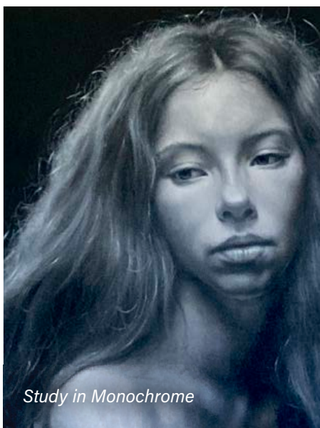
Study in Monochrome