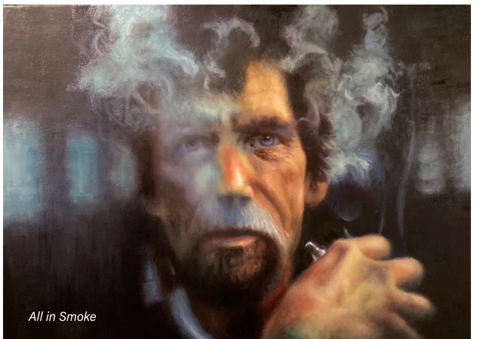
All in Smoke