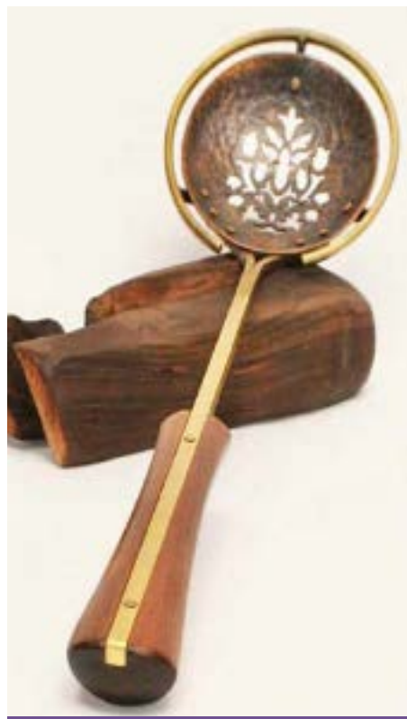
Pierced Spoon by Danny Saathoff

B83224 Mondays, October 28 - December 16 (8 sessions) 12:30 - 3:30 p.m. $412 Members / $451 Non-members