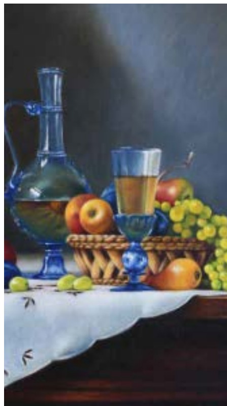
Venetian Glass by Dan Petrov

B45924 Thursdays, October 31 - December 19 (7 sessions) 1 - 4 p.m. No class on November 28 $254 Members / $282 Non-members