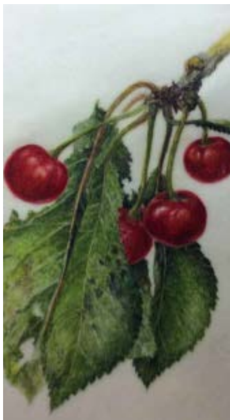
Crabapples by Kathy Creger

B44324 Tuesdays, November 5 - December 3 (5 sessions) 1 - 4 p.m. $181 Members / $201 Non-members