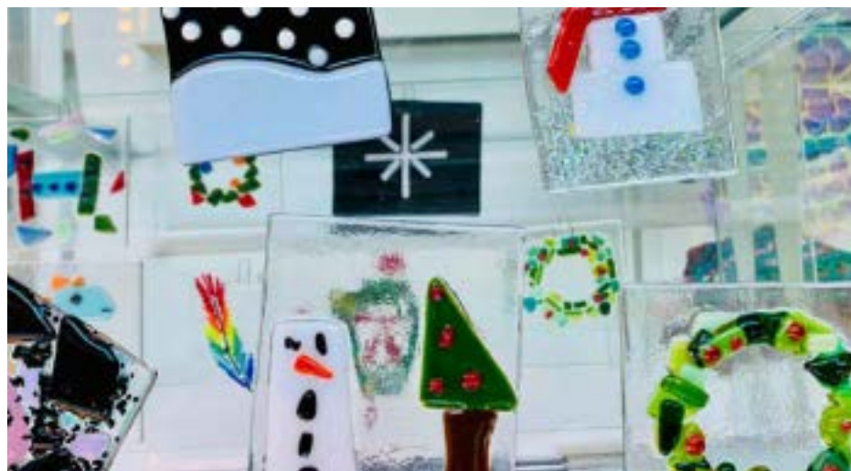
Gorgeous Glass Ornaments

B137W24 Saturday, November 9 (1 session) 10 a.m. - Noon $53 Members / $58 Non-members