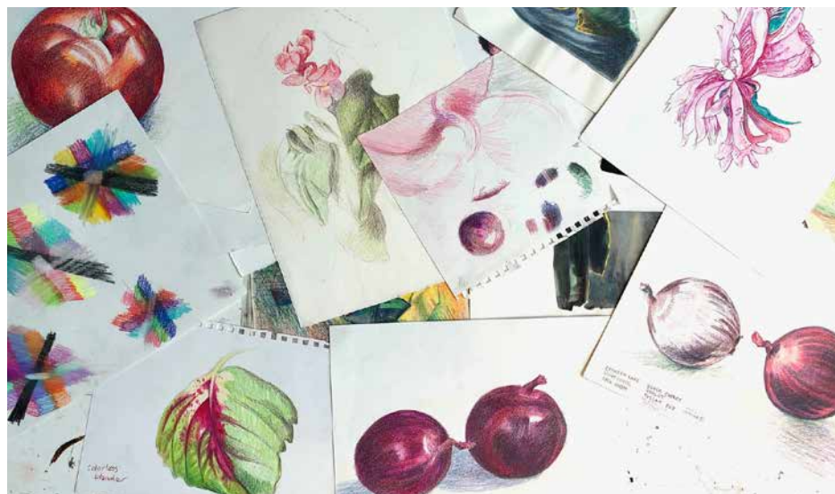
Studies by Bonnie Lauber-Westover

B40524 Mondays, October 28 - December 16 (8 sessions) 1 - 4 p.m. $290 Members / $322 Non-members