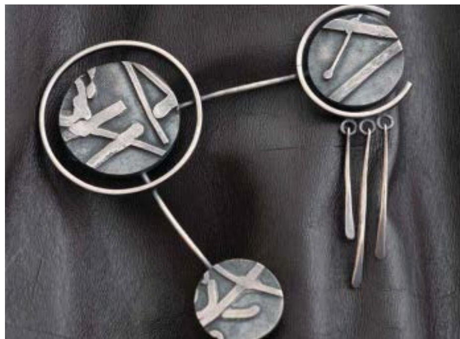
Brooch by Molly Sandweiss

B85124 Tuesdays, November 5 - December 18 (6 sessions) 6 - 9 p.m. $325 Members / $354 Non-members