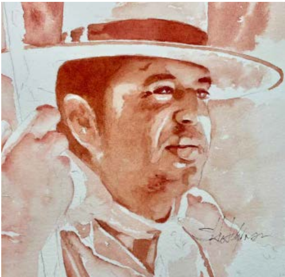
Watercolor Portrait by Sonja Hutchinson

A026W24 Tuesdays, October 8 - 15 (2 sessions) 5:30 - 7:30 p.m. $93 Members / $102 Non-members