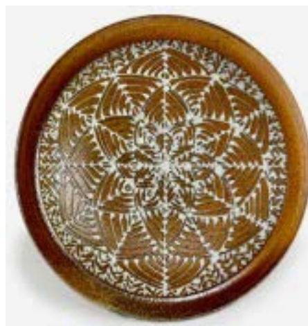
Platter by Clarice Allgood

B91224 Mondays, October 28 - December 16 (8 sessions) 1 - 4 p.m. $347 Members / $386 Non-members