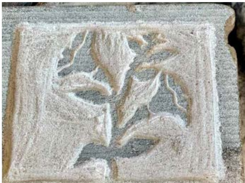
Student stone carving

B82924 Thursdays, October 31 - December 19 (7 sessions) 12:30 - 3:30 p.m. No class on November 28 $319 Members / $353 Non-members