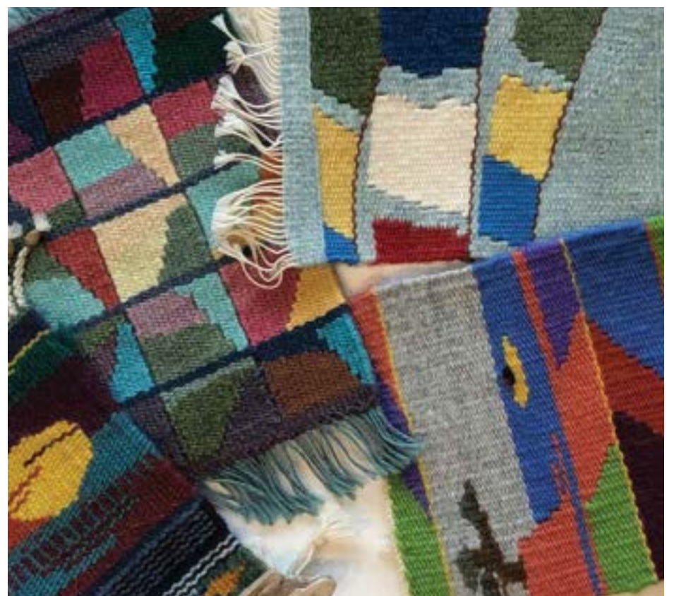
Weavings by Traudi Bestler

B78124 Thursdays, October 31 - December 19 (7 sessions) 9:30 a.m. - 12:30 p.m. No class on November 28 $254 Members / $282 Non-members