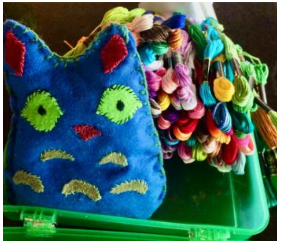
Fall Fun with Felt