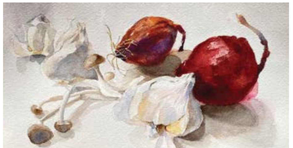
Garlic Mushroom Onions by Coco Connolly

B49824 Tuesdays, November 5 - December 3 (5 sessions) 6 - 9 p.m. $181 Members / $201 Non-members