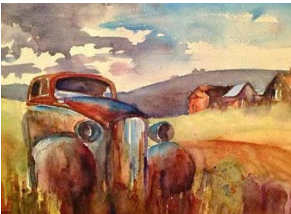
Final Rest by Vera Kovacovic

B49024 Fridays, November 1 - December 20 (7 sessions) 9 a.m. - Noon No class on November 29 $254 Members / $282 Non-members