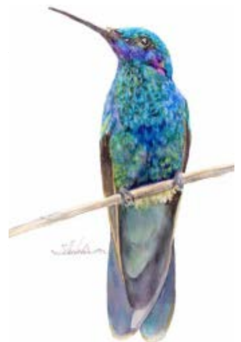
Hummingbird by Sonja Hutchinson

B444W24 Wednesday, November 13 (1 session) 9:30 a.m. - 4 p.m. $124 Members / $138 Non-members