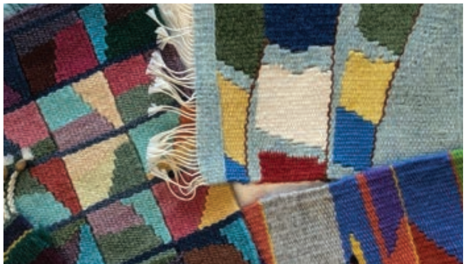
Weavings by Traudi Bestler