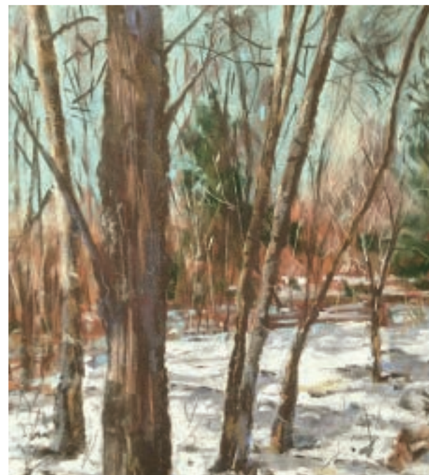
Melding and Melting