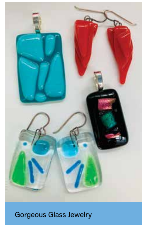
Gorgeous Glass Jewelry

G727W25 Friday, August 8 (1 session) 10 a.m. - 1 p.m. $82 Members / $89 Non-members