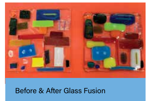
Before & After Glass Fusion