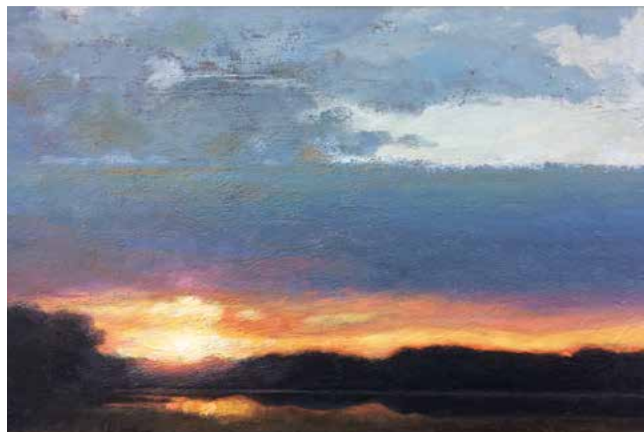
Kevin Kluever Painting Skies

F451W25 Mondays, June 23 - July 7 (3 sessions) 1 - 4 p.m. $186 Members / $207 Non-members