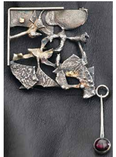
Fused Brooch by Molly Sandweiss

G85725 Thursdays, July 24 - August 21 (5 sessions) 6 - 9 p.m. $262 Members / $286 Non-members