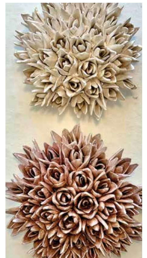
Krissy Catt Ceramic Sculpture

F94125 Wednesdays, June 25 - August 13 (8 sessions) 1 - 4 p.m. $347 Members / $386 Non-members