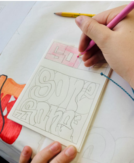
Comic Arts for Kids

Enrollment limited to 12; ages 6 to 10 D19726 Saturdays, February 28 - April 18 ( 7 sessions ) 9:30 a.m. - 11:00 a.m. No class April 4 $146 Members / $161 Non-members E19726 Saturdays, April 25 - June 6 ( 7 sessions ) 9:30 a.m. - 11:00 a.m. $146 Members / $161 Non-members