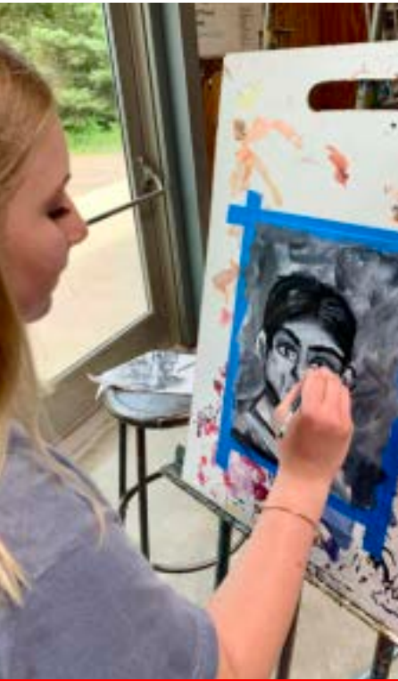
Special Projects Painting

Enrollment limited to 12; ages 11 to 15 E18026 Saturdays, April 25 - June 6 ( 7 sessions ) 1:30 p.m. - 3:00 p.m. $146 Members / $161 Non-members