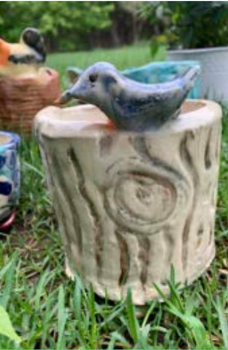
Fantastic Flower Pots

Young artists will have the chance to try both watercolors and acrylic paints in this painting studio. Each class will begin with exercises in color theory, color mixing, and color relationships. Then using what you have learned you will make paintings of animals, still lifes, landscapes, and much more. Brush handling, dry brush, sgraffito, gestural, dabbing, palette knives, and other techniques will be explored as you learn about expressionism, impressionism and finding your own favorite ways to paint.