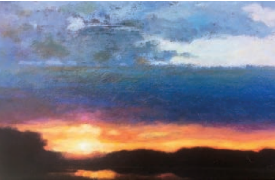
Kevin Kluever Painting Skies

Enrollment limited to 12; ages 16 and up D437W26 Friday - Saturday, April 10 - 11 (2 sessions) 9:00 a.m. - 12:00 p.m. $131 members / $145 non-members