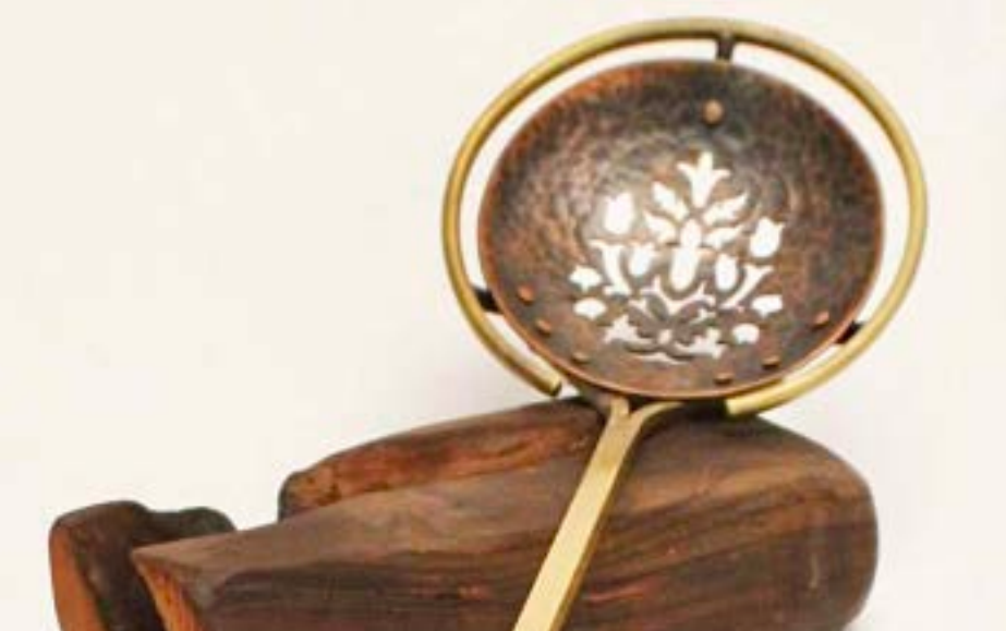
Danny Saathoff Pierced Spoon

Enrollment limited to 14; ages 16 and up D85726 Wednesdays, February 25 – April 15 (8 sessions) 12:30 – 3:30 p.m. $410 members / $450 non-members E85726 Wednesdays, April 22 – June 3 (7 sessions) 12:30 – 3:30 p.m. $364 members / $399 non-members