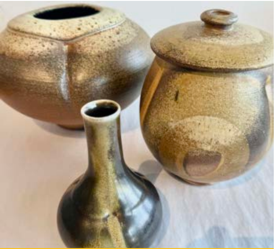
Stoneware Pottery by Lee Persell

E91226 Mondays, April 20 – June 8 (7 sessions) 1:00 – 4:00 p.m. No class May 25 $319 members / $354 non-members