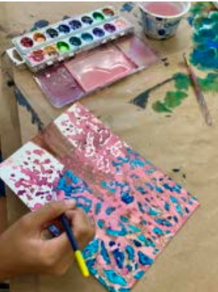
Youth Painting Studio

Enrollment limited to 12; ages 6 to 10 D17326 Saturdays, February 28 - April 18 ( 7 sessions ) 9:30 - 11:00 a.m. No class April 4 $146 Members / $161 Non-members E17326 Saturdays, April 25 - June 6 ( 7 sessions ) 9:30 - 11:00 a.m. $146 Members / $161 Non-members