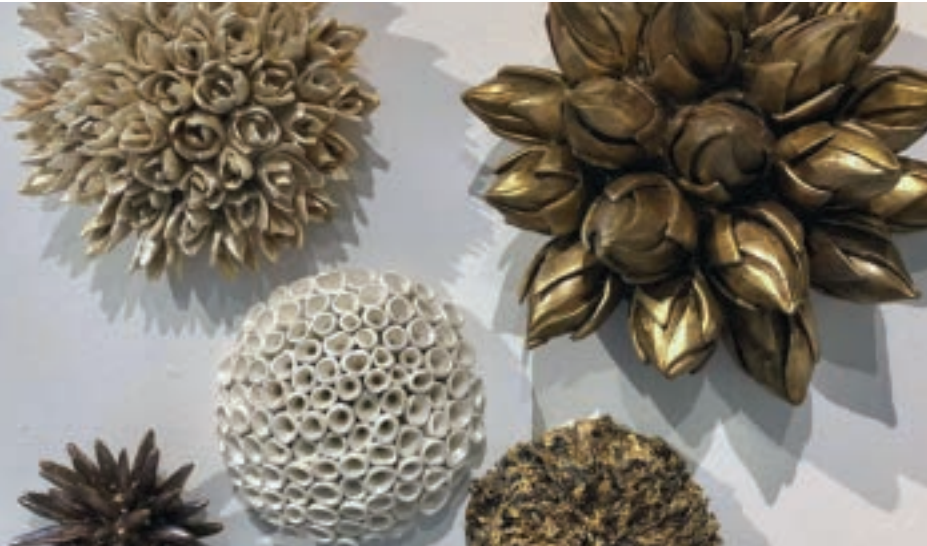
Ceramic Sculpture by Krissy Catt

In this off-the-wheel class, students create a wide variety of projects ranging from figurative work (animals and human) to realistic or abstract forms, to clay totems, and more. You will learn proper interior structure for a sculpture made of clay and have fun with surface design and textures. It's important that you come to the first class with an idea, sketch or image of the project you intend to create, so our studio time can be used to complete it. Bring a towel and a small (gallon or less) bucket for water. Tools and clay can be purchased in MCFTA's retail shop.