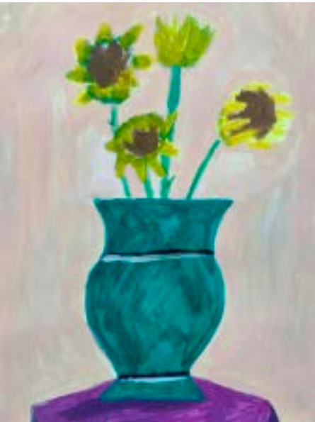
Painting Essentials for Tweens

To learn more about painting this hands-on class will guide you through the elements that are essential to painting. Composition, color palettes, brush handling tips are some of the things you will practice as you create your paintings. Light, color, contrast, depth and perspective will be discussed as you learn about some famous artworks, styles, and begin to develop your own.