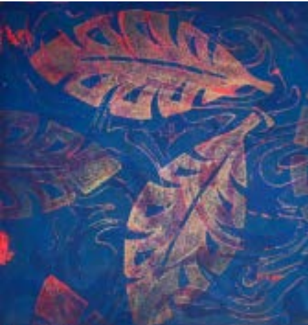
Gel Plate Printmaking by Lynn F. Pierson

Moving beyond the translucent gel prints of previous workshops, this time we'll be creating multicolor opaque prints without using a press or irritating solvents! Gel printing, using a polymer gel plate, offers an accessible printmaking method and cleans up easily, allowing you to create images more quickly and experimentally than other printmaking techniques. You can layer images, and incorporate stamps and stencils to expand your options. We'll work on a smaller scale that allows you to complete three or four images. Price includes $35 materials fee.