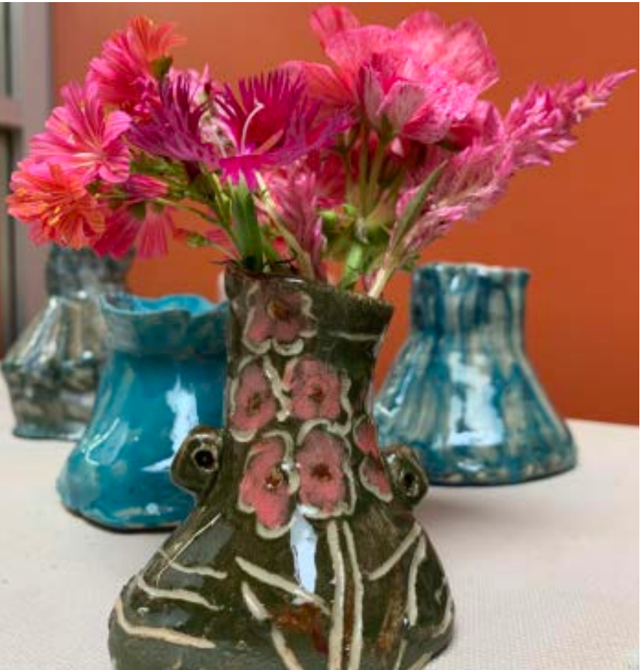
Ceramic Bud Vases

Enrollment limited to 12; ages 8 and up E137W26 Saturday, May 2 (1 session ) 10:00 a.m. - 12:00 p.m. $60 Members / $65 Non-members