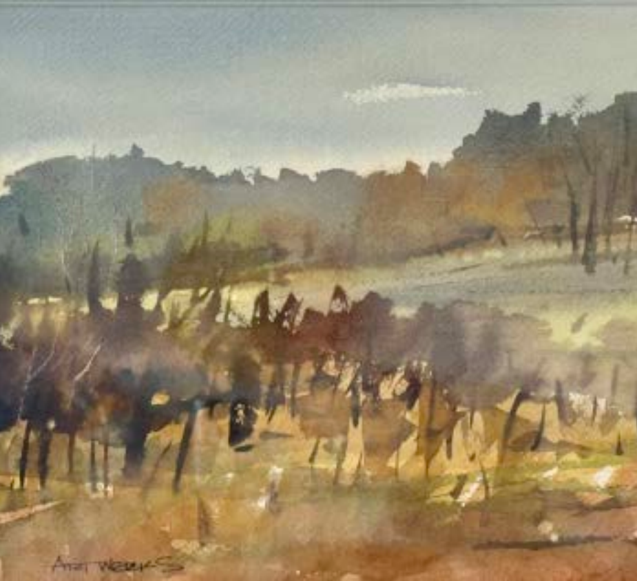
Watercolor Landscape by Art Weeks

Enrollment limited to 14; ages 16 and up D41526 Tuesdays, February 24 – April 14 (8 sessions) 1:00 – 4:00 p.m. $304 members / $338 non-members E41526 Tuesdays, April 21 – June 9 (8 sessions) 1:00 – 4:00 p.m. $304 members / $338 non-members