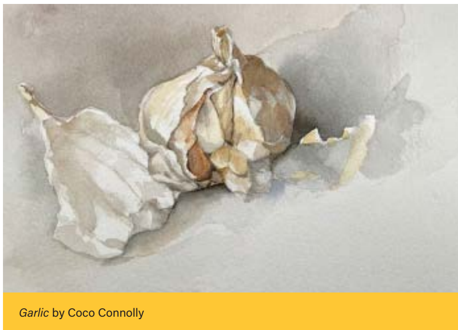
Garlic by Coco Connolly

G47026 Tuesdays, July 21 - August 18 (5 sessions) 1 - 4 p.m. $190 members / $211 non-members