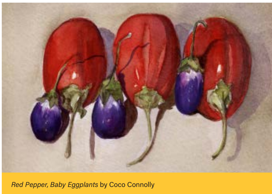
Red Pepper, Baby Eggplants by Coco Connolly