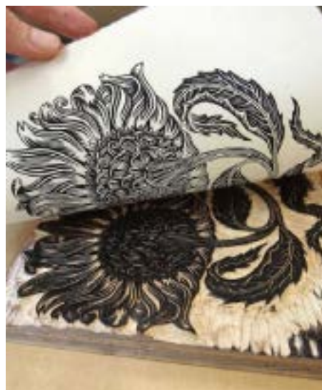
Linoleum Block Printing Workshop

F964W26 Tuesday, June 16 (1 session) 9:30 a.m. - 12:30 p.m. $65 members / $72 non-members