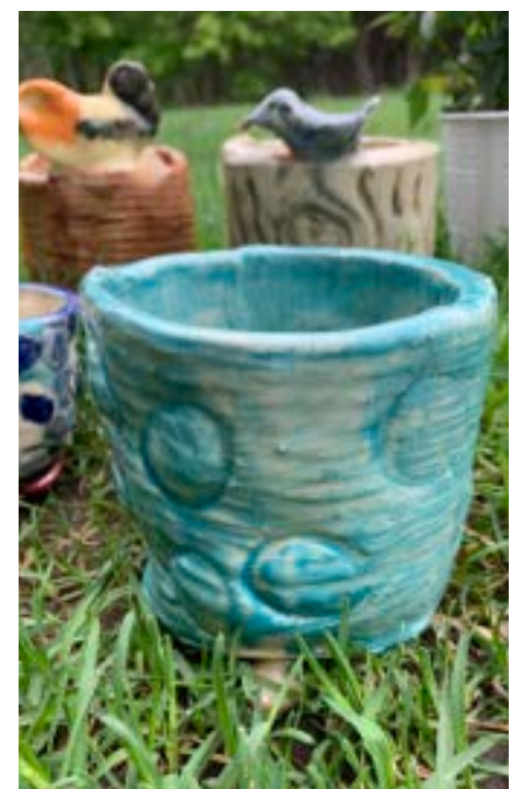
Fantastic Flower Pots