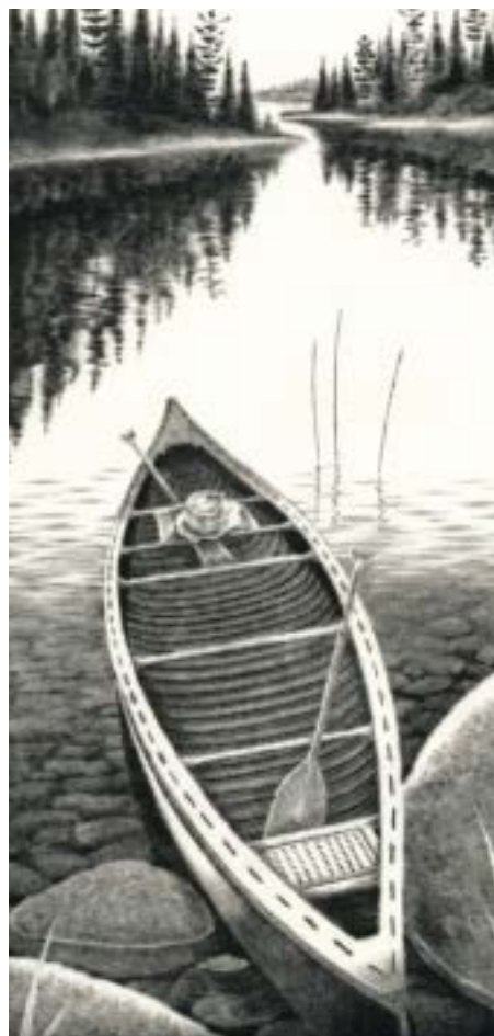
Canoe by Bill Reynolds

G40726 Wednesdays, July 22 - August 12 (4 sessions) 10 a.m. - Noon $102 members / $113 non-members