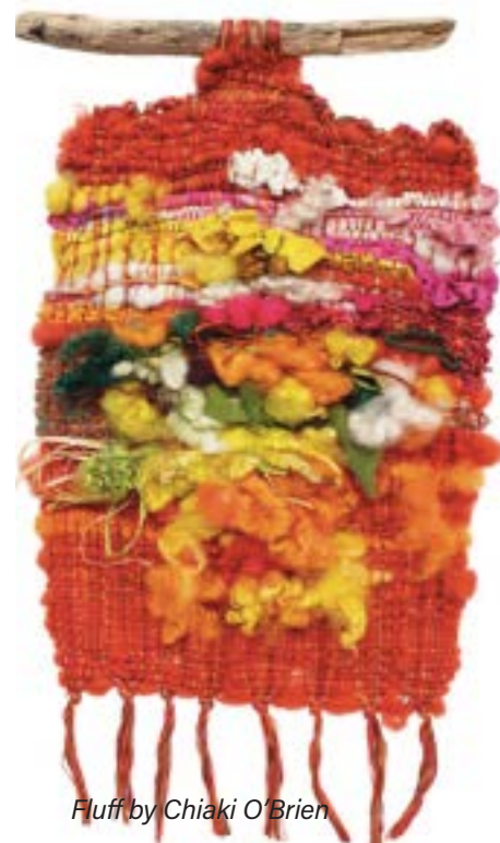
Fluff by Chiaki O'Brien

Chiaki teaches Saori Weaving Multigenerational for ages 9 through adult.