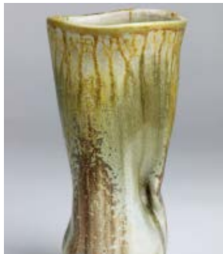
Altered Tumbler by Blake Stolpestad

G91226 Mondays, July 20 - August 17 (5 sessions) 1 - 4 p.m. $228 members / $253 non-members